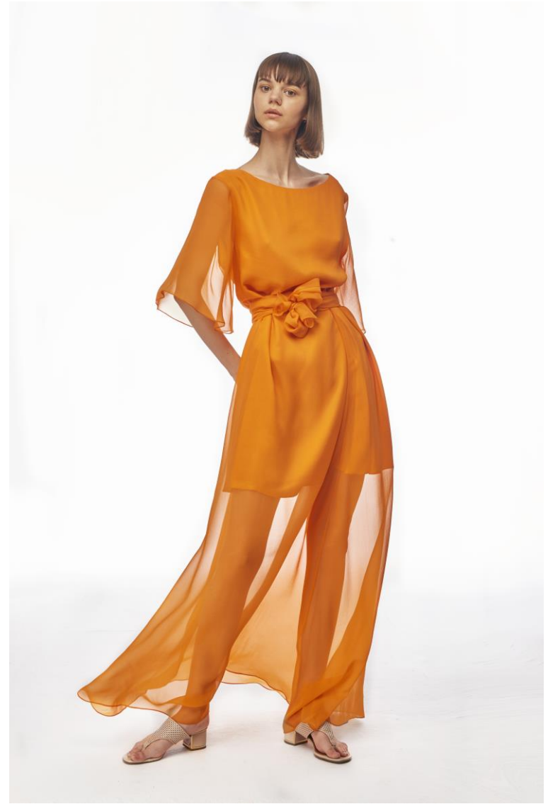
TIGER LILY DRESS