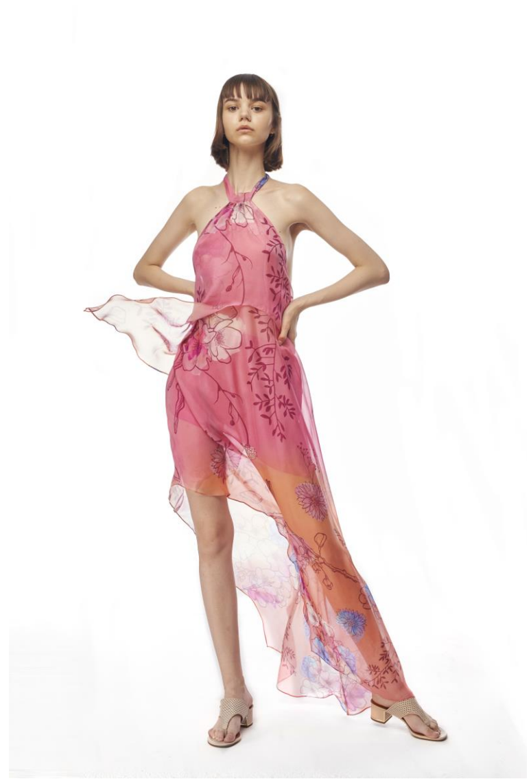
LOTUS DRESS WITH SHORT LINING