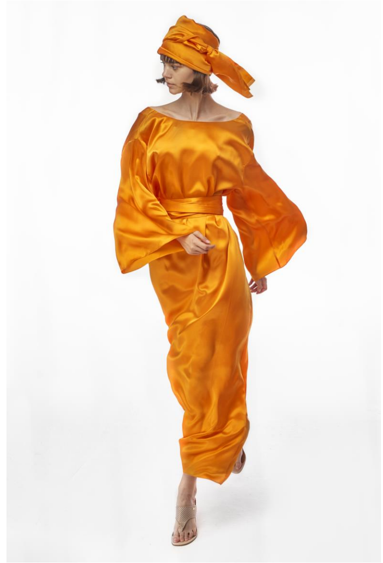
CHRYSANTHEMUM KIMONO DRESS