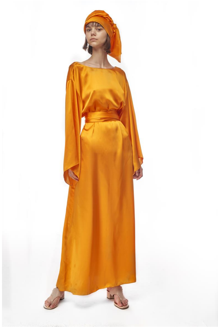
CHRYSANTHEMUM KIMONO DRESS