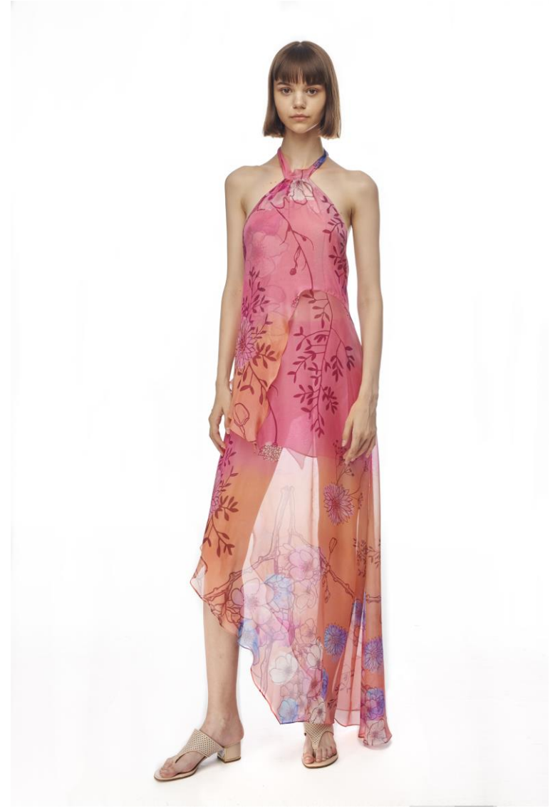
LOTUS DRESS WITH SHORT LINING