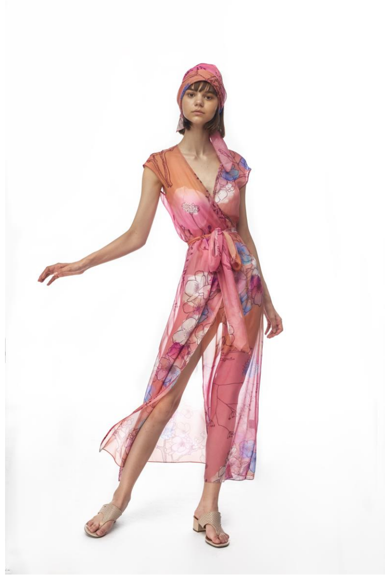
LOTUS COVER UP