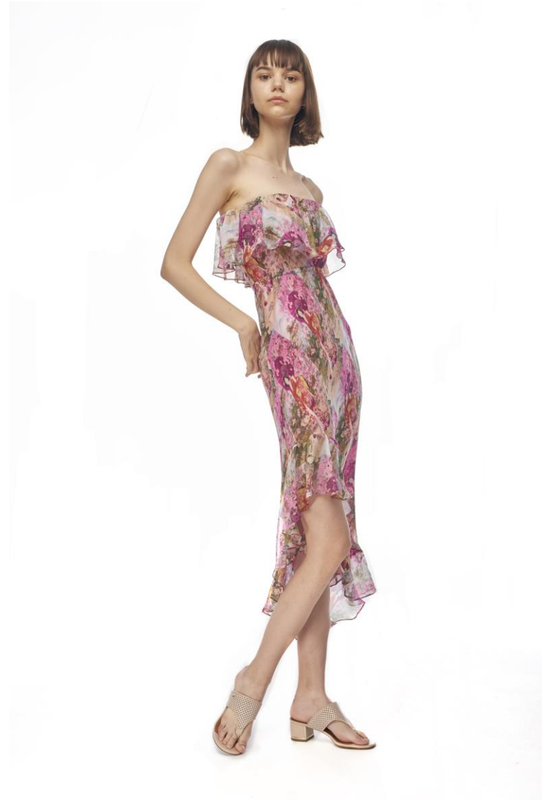
ORCHID STRAPLESS DRESS