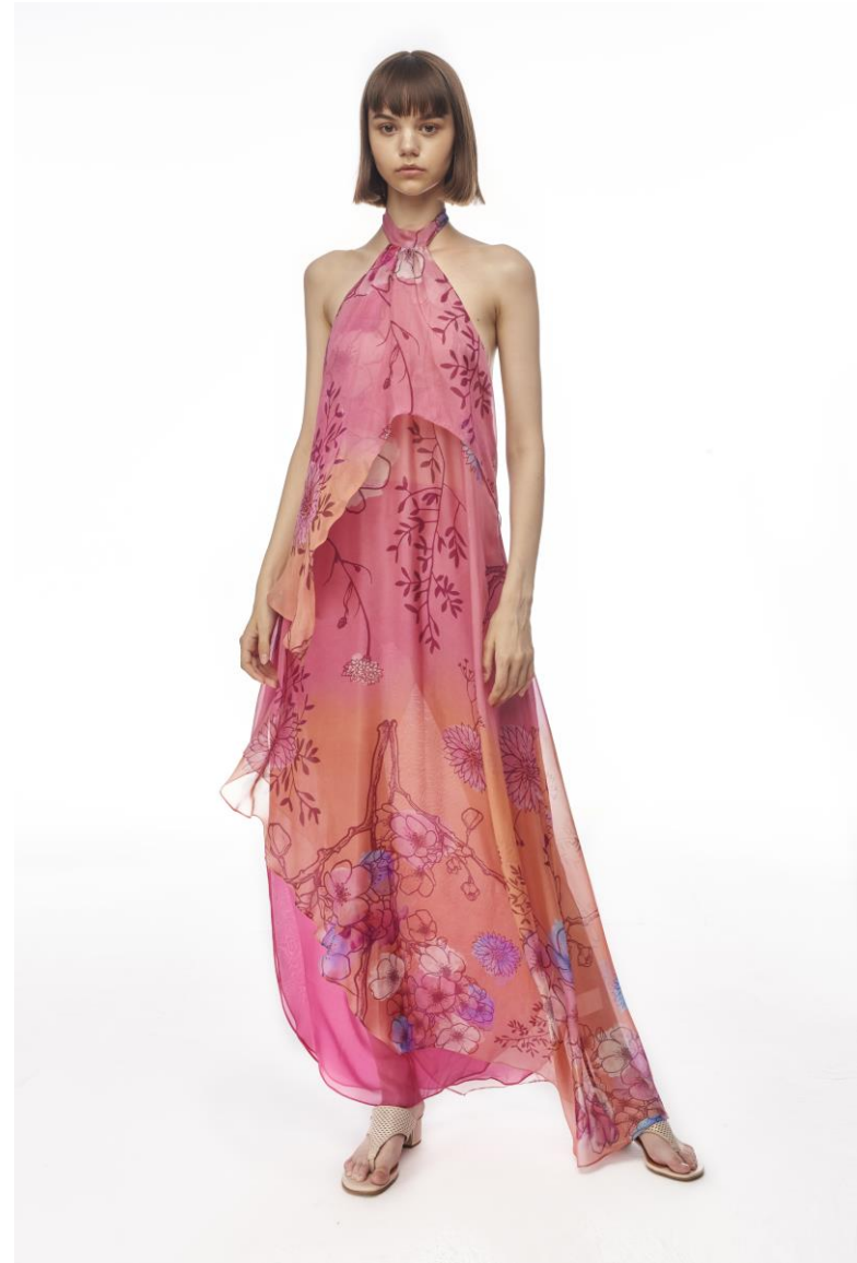
LOTUS DRESS WITH LONG LINING