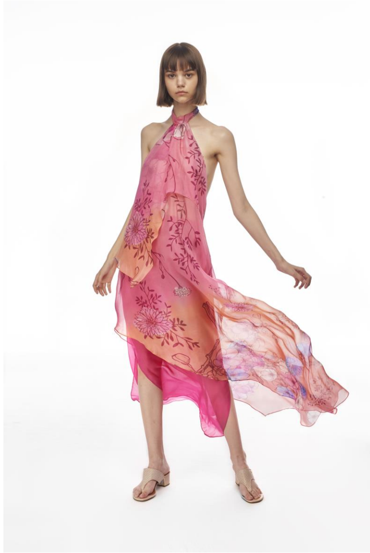
LOTUS DRESS WITH LONG LINING