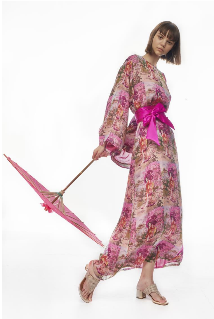
ORCHID KIMONO DRESS