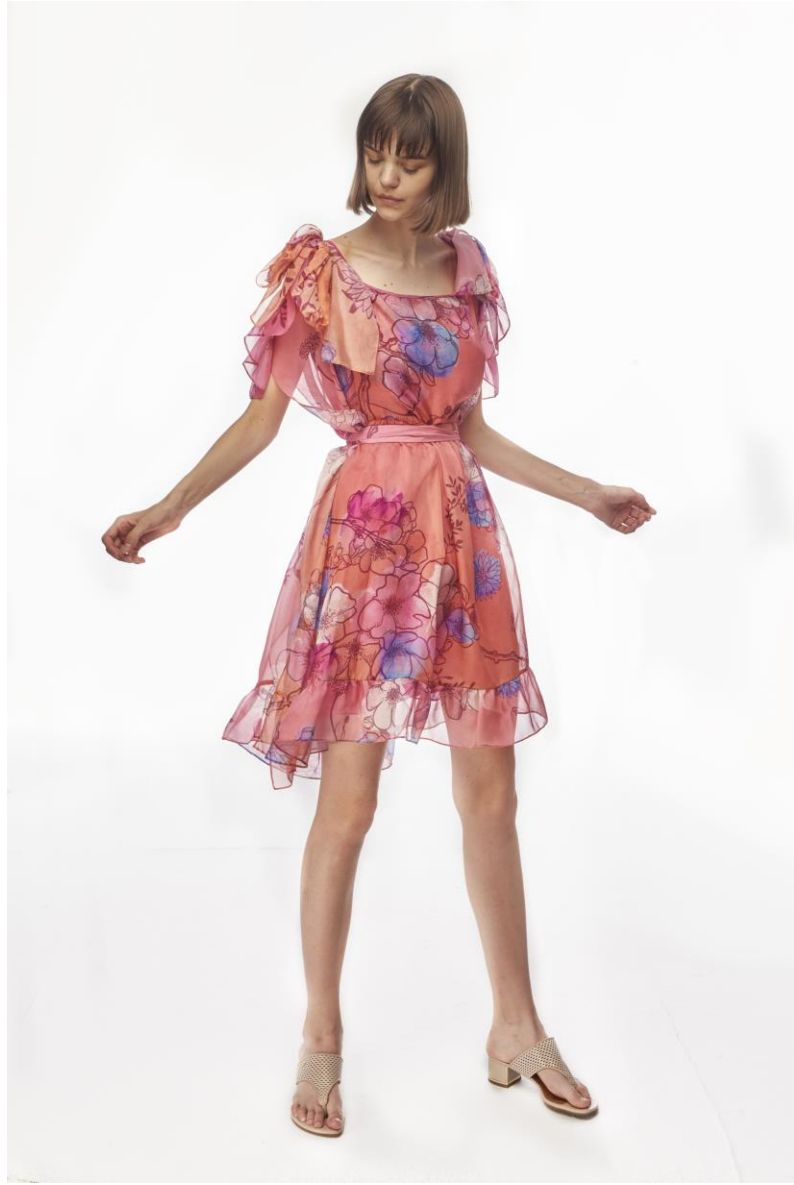
LOTUS SHORT DRESS