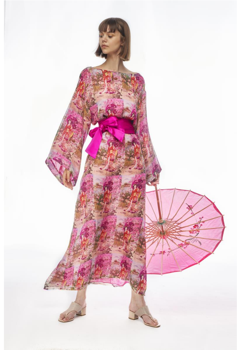
ORCHID KIMONO DRESS