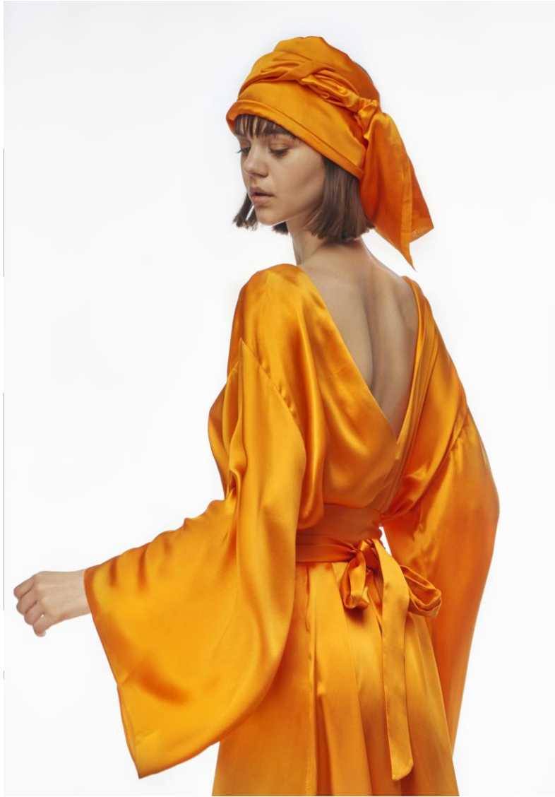
CHRYSANTHEMUM KIMONO DRESS