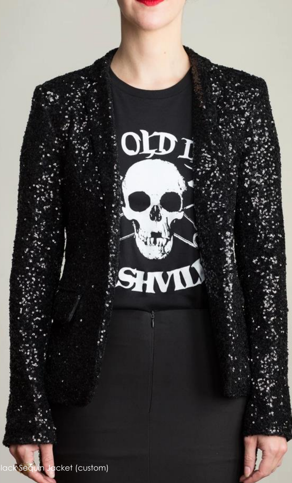
Black Sequin Jacket (custom)