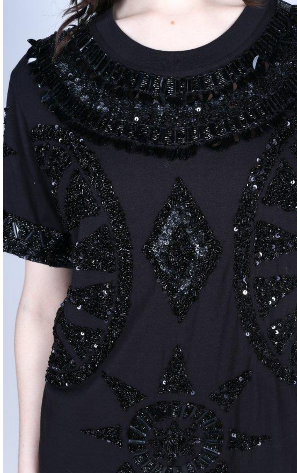
Aztec Star Tee