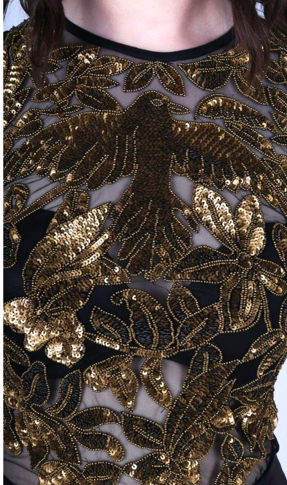
Golden Birds Body Suit