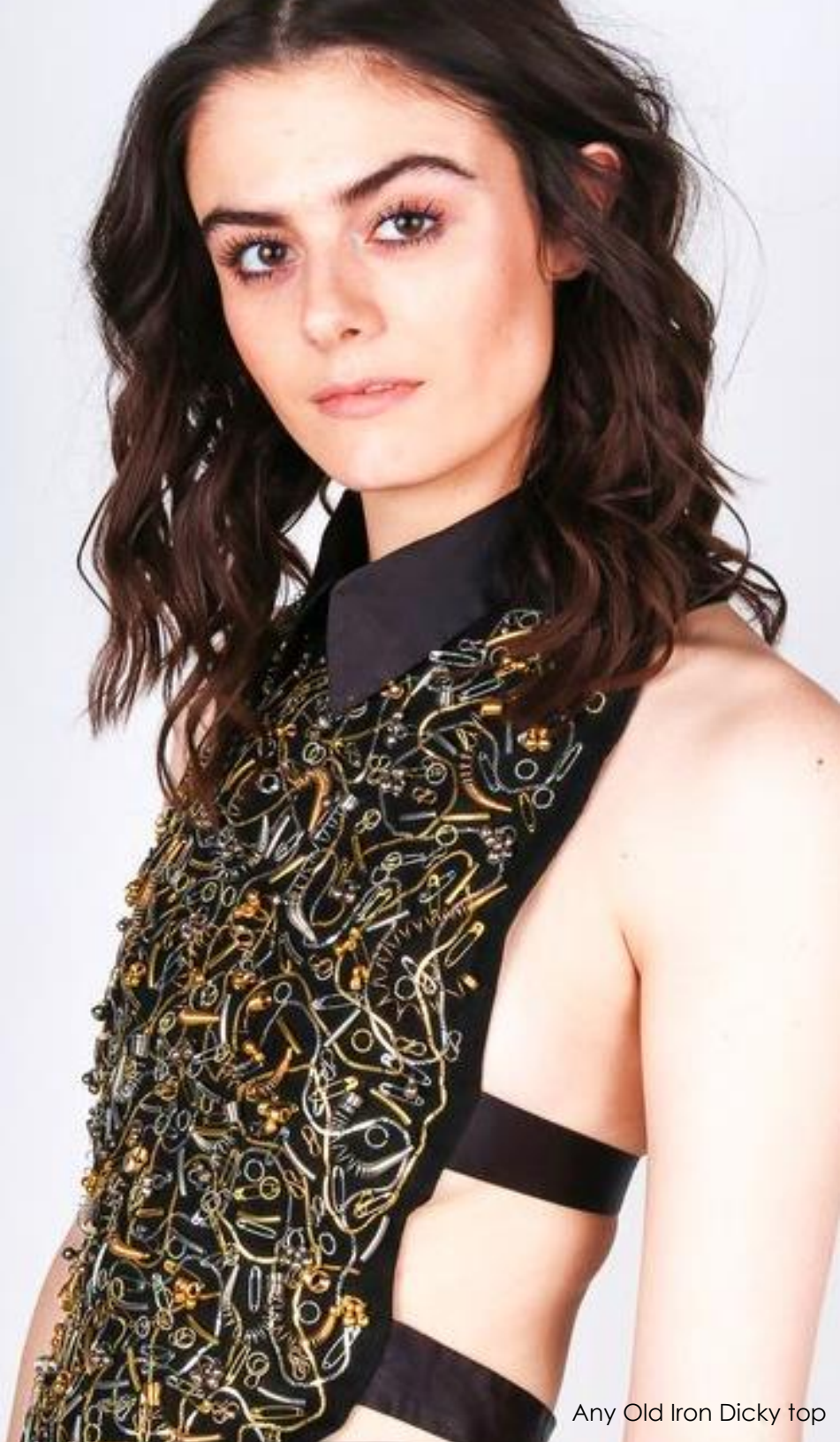
Any Old Iron Dicky top