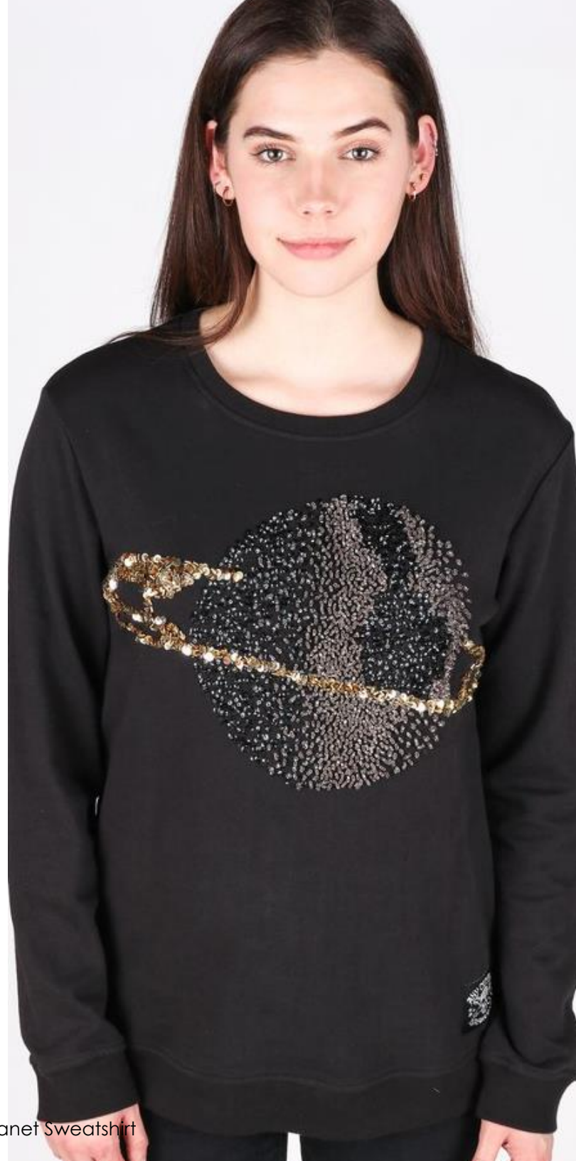
Disco Planet Sweatshirt