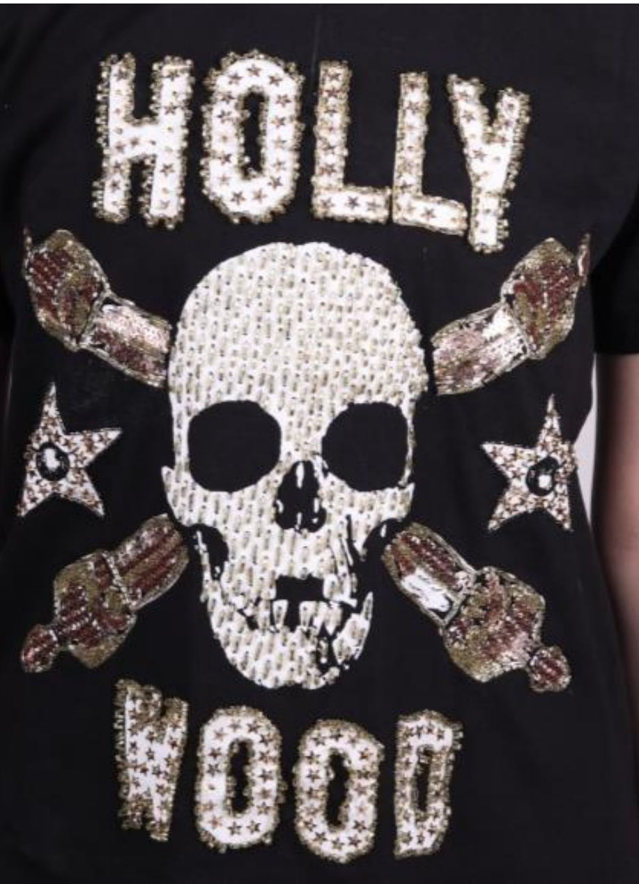
New York Tee