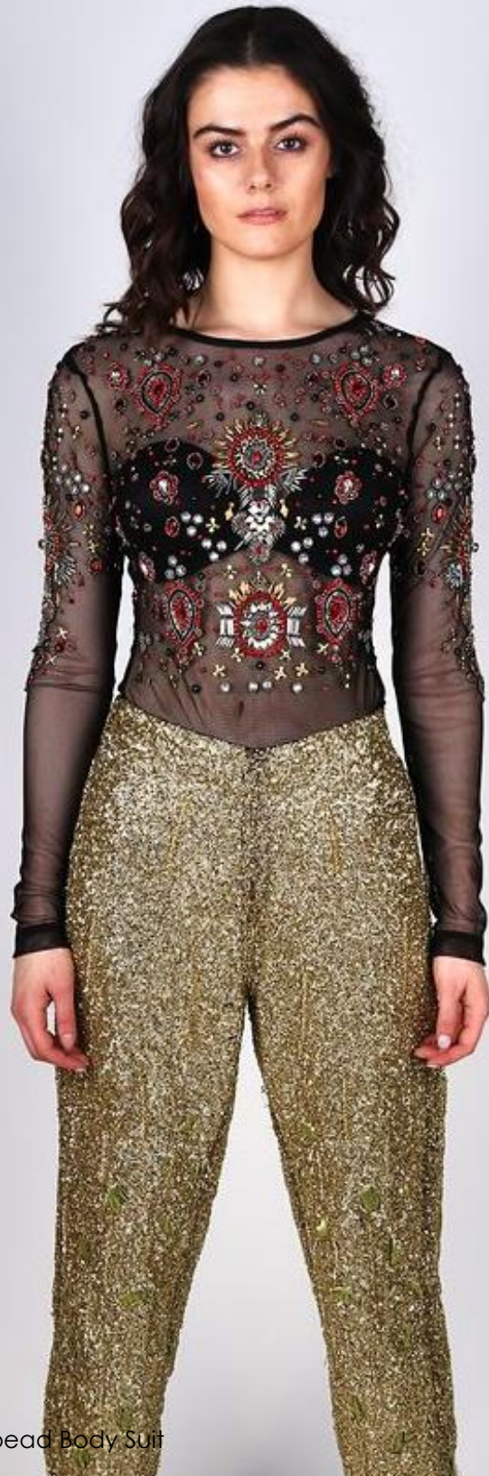
Redbead Body Suit