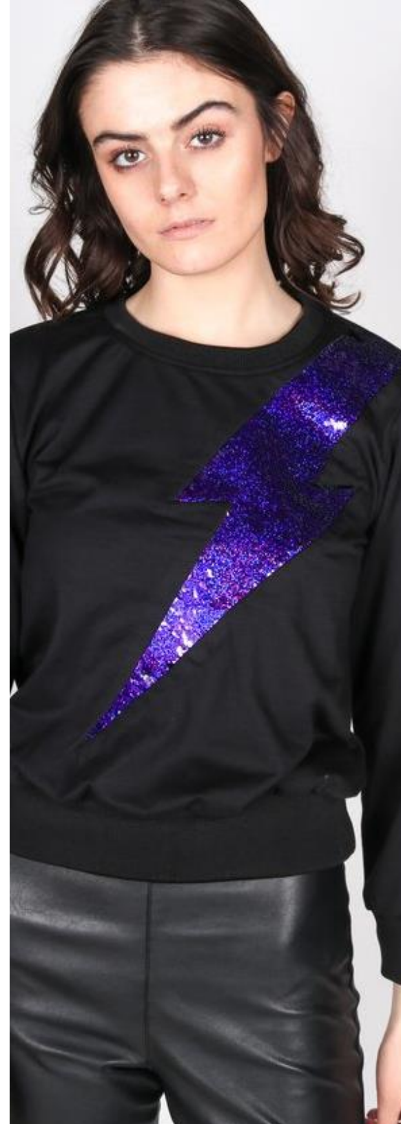
Lightning Sweatshirt & Tee