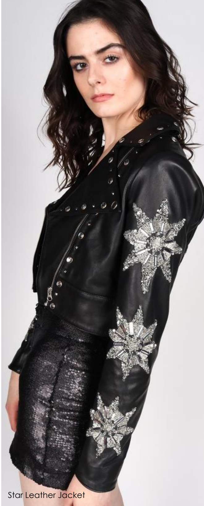
Star Leather Jacket