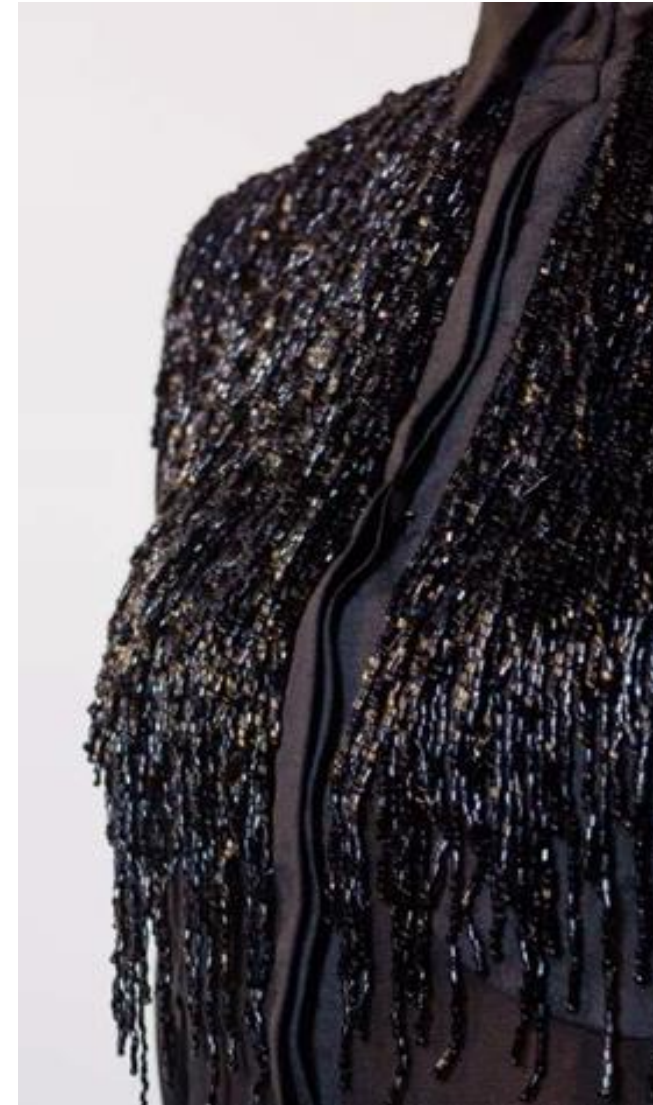
Beaded Fringe Shirt