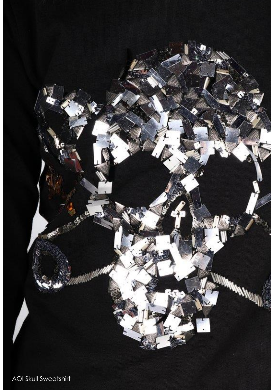
AOI Skull Sweatshirt