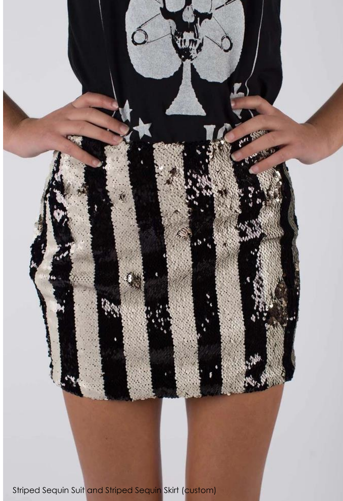
Striped Sequin Suit and Striped Sequin Skirt (custom)